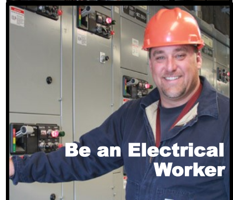
Be an Electrical Worker

BAYWORK Career Fair Wednesday, February 27, 2019 (2-5pm)