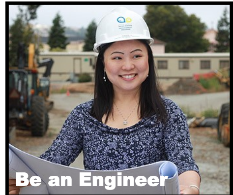
Be an Engineer