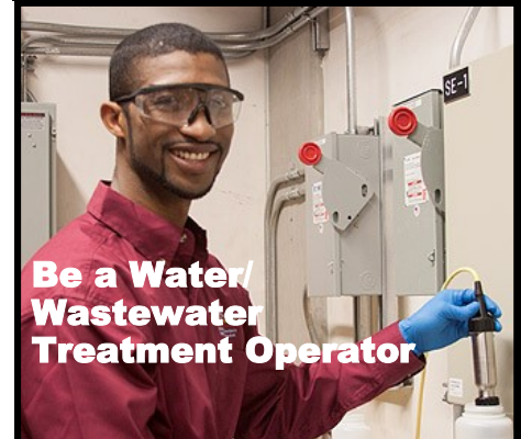
Be a Water/ Wastewater Treatment Operator