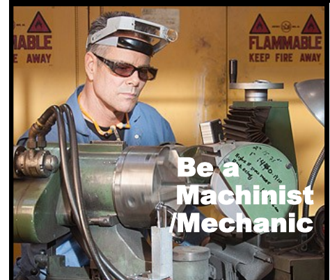
Be a Machinist /Mechanic